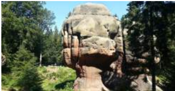
Upper Turonian Sandstone Goblet Stone 90 minutes walk guided tour