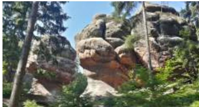
Upper Turonian Sandstone Rose Stone 90 minutes walk guided tour