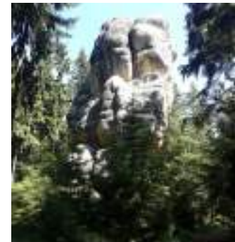
Upper Turonian Sandstone Guard 60 minutes walk guided tour

Please note: There are unfortunately no carbonate outcrops in the closer vicinity.