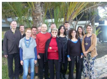
KINDRA project partners